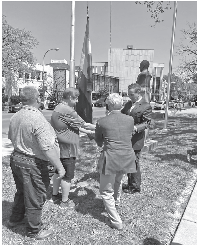
Elected leaders and Niagara County Pride members team to raise a Pride Month flag in Niagara Falls.